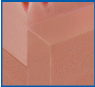
Firm perimeter side rail

Bariatric Mattress - Exceptional support for demanding situations