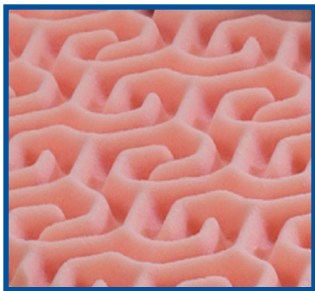
Unique "comfort saver" foam