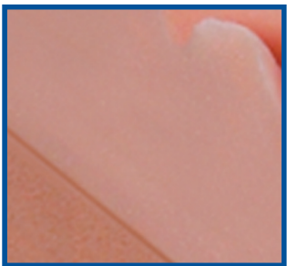
Multi layer foam core with increasing density for patient comfort