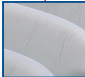
Individual replaceable air bladders provide low air loss and pressure reduction