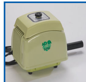
Electric air pump provides constant air flow for pressure adjustment as needed